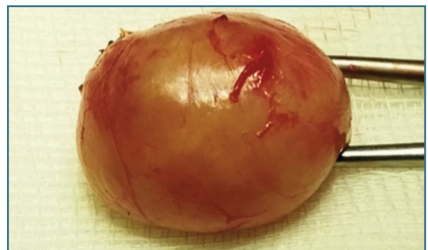
FIGURE 5. Gross picture of the excised lesion following resection from the anterior wall of the vagina pressed by a pozzi forceps.

Further pelvic magnetic resonance imaging revealed the presence of a nodular structure in the right anterolateral side of the lower third of the vagina, well-defined, with smooth and regular edges, posterior to the urethra, although with a cleavage plane, characteristics overlapping with a leiomyoma (Figure 3). Additionally, she presented multiple bilateral inguinal lymph node formations, with no criteria for adenomegaly.