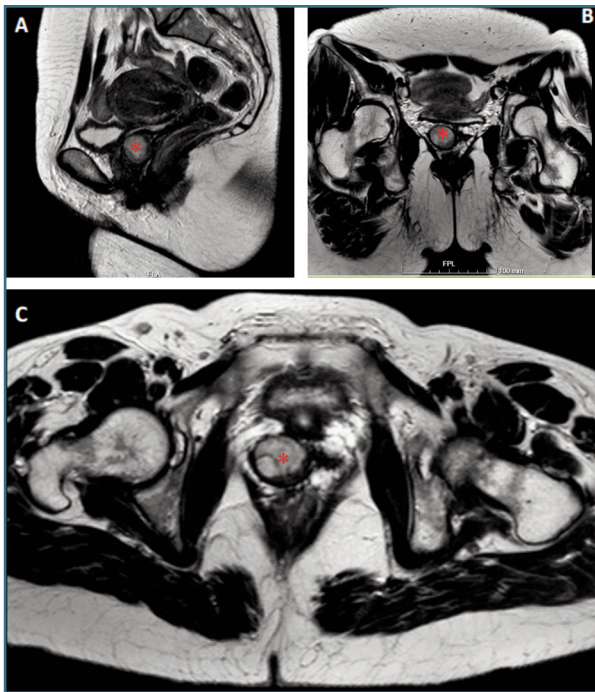
FIGURE 3. Vaginal nodular formation (*) in MRI in the sagittal (A) and axial plane (B and C).

As the vaginal mass had a close relation with the urethra, collaboration from Urology was requested and surgical excision decided. No invasion of the urethra was recognized.