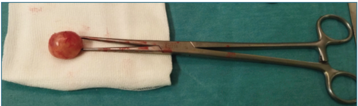
FIGURE 4. The excised lesion from the anterior wall of the vagina.

The case was presented in our Multidisciplinary Tumour Board, and it was decided to maintain a close follow up in an oncological appointment with no additional surgery and no adjuvant therapy. A Thoraco-abdominal-pelvic computed tomography scan was made in the first year of follow-up and no imaging anomalies